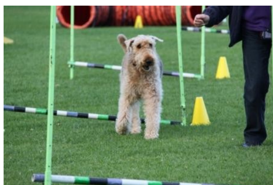
ABOVE: Major having a great time.