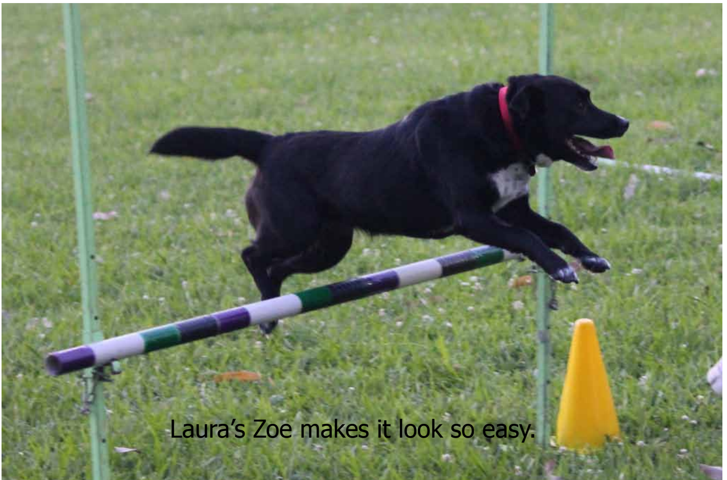
Laura's Zoe makes it look so easy.